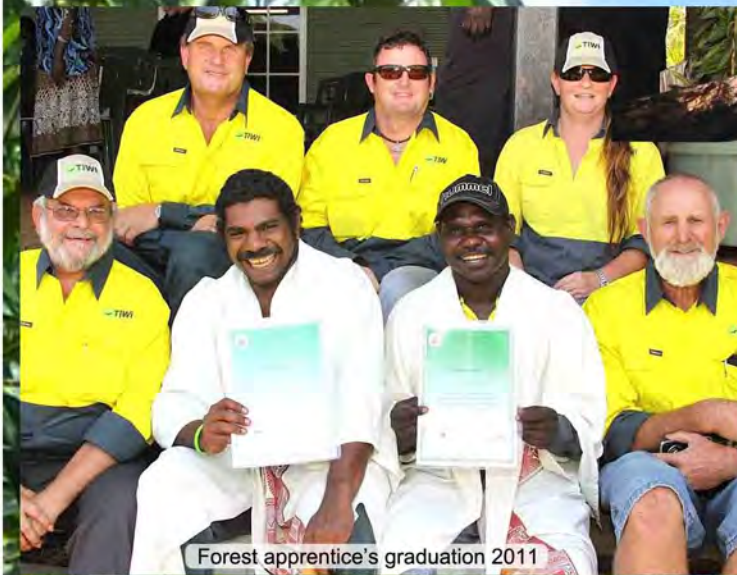
Forest apprentice's graduation 2011