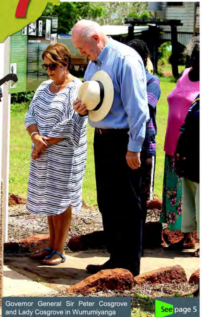
Governor General Sir Peter Cosgrove and Lady Cosgrove in Wurrumiyanga