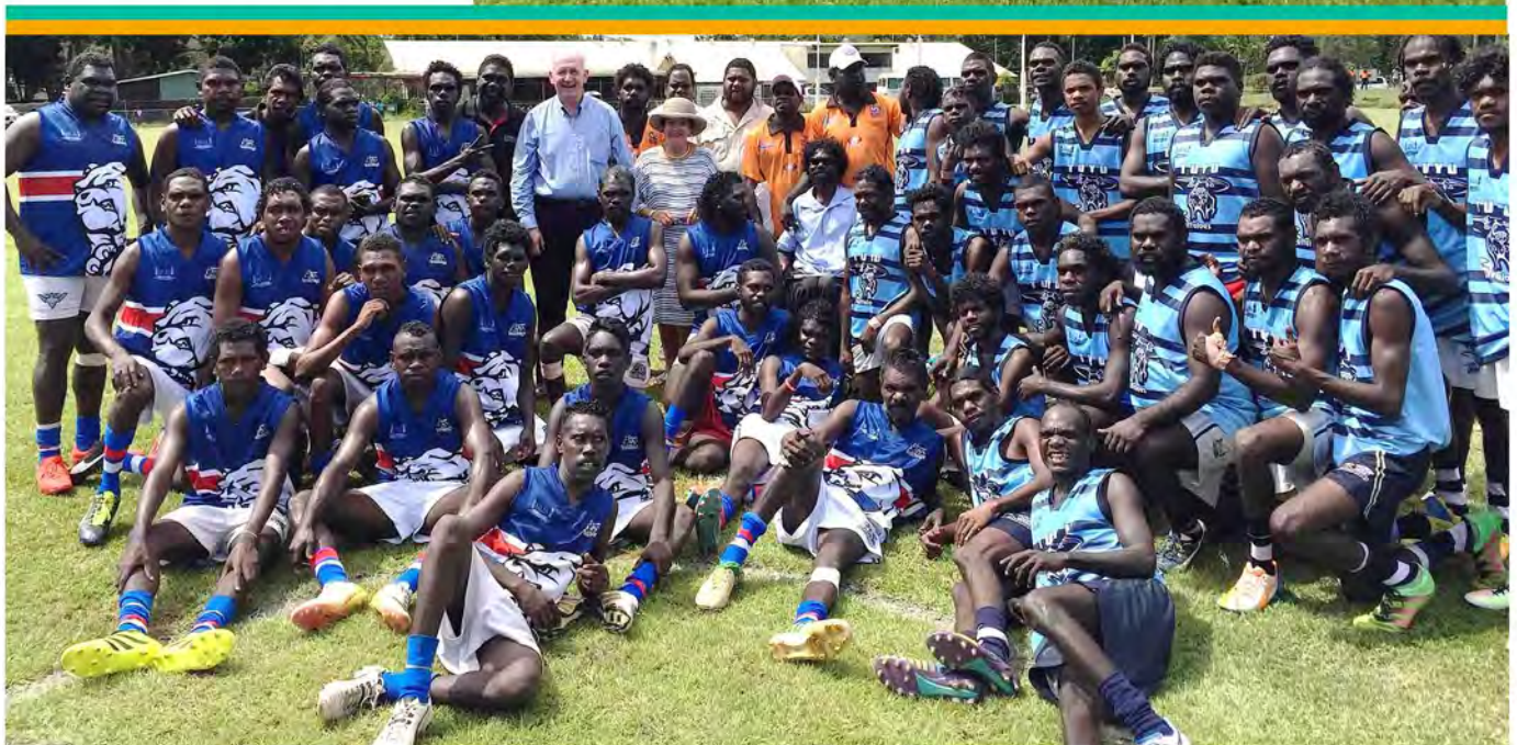
Governor General Sir Peter Cosgrove and Lady Cosgrove meet the Bulldogs and Buffaloes