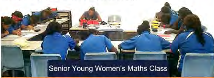
Senior Young Women's Maths Class

We also say thank you to the students for their great attitude about returning to school after the holidays. The weather and roads have made transport difficult. Thank you to all the students who patiently waited for our troopies to get to their community!